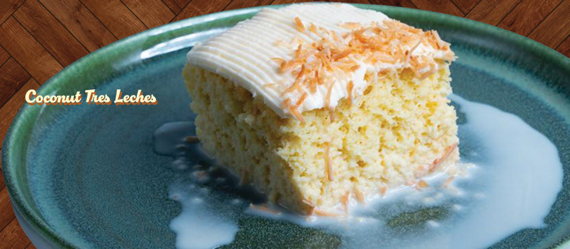
Coconut Tres Leches