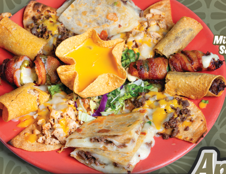
Mi Rancho Sampler